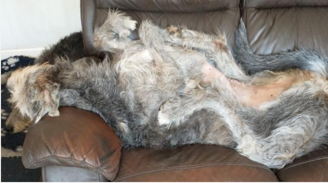
Myrtle getting comfy on the settee

As I work from home most of the week anyway, I was lucky to be able to change my routine and work for the full week from home and make sure she had a full-time nursemaid to keep an eye on her during her recovery.