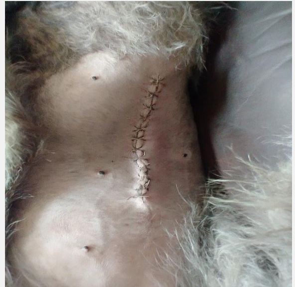
The operation site

My vet seems surprised that we always have this reaction as it seems well-tolerated by the rest of the dog population, so perhaps it's a wolfhound thing – maybe that's a question for a future project?