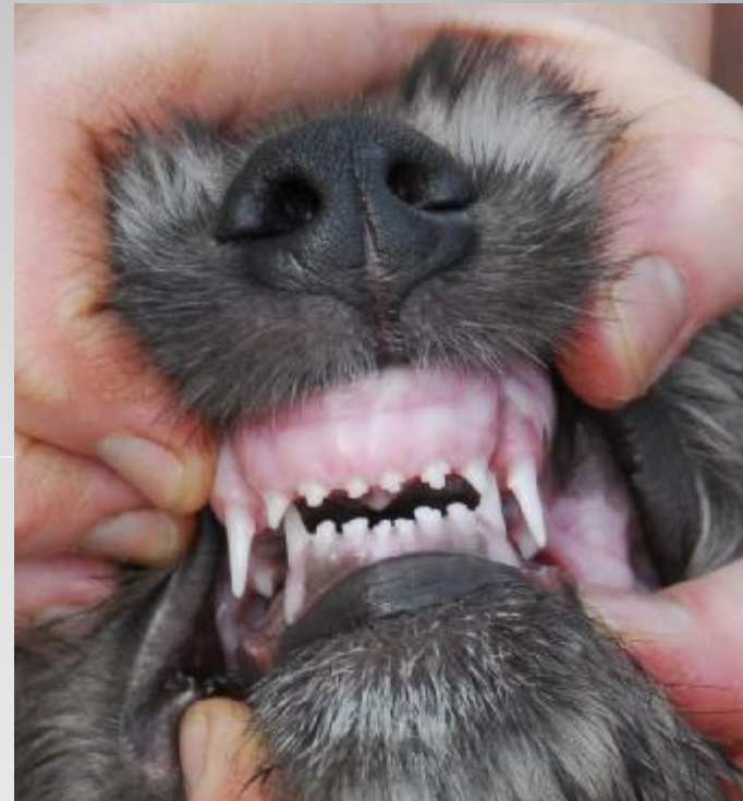
9 week old pup with lingual displacement of the lower canines