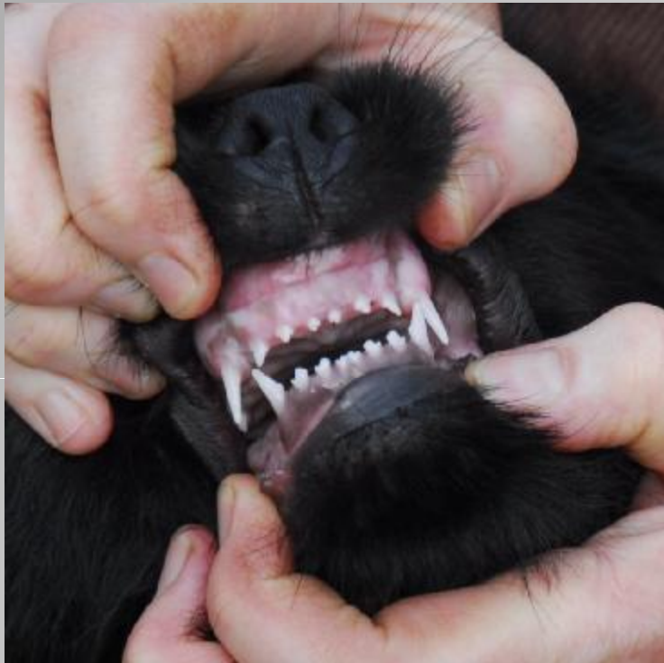
9 week old pup with normal occlusion